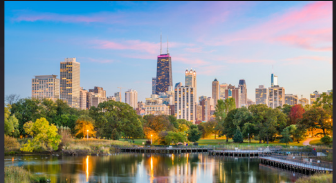
Rainmaker Summit Summer Chicago