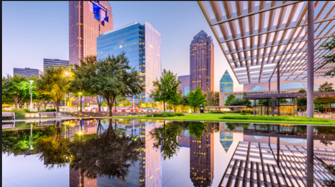
Rainmaker Summit Spring Dallas