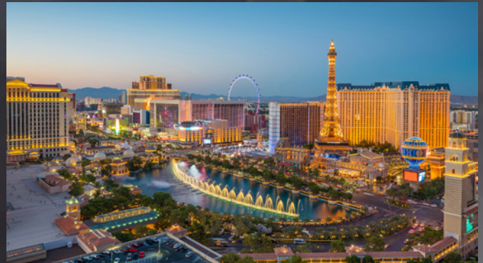
Rainmaker Summit Winter Las Vegas

FOR MORE INFORMATION VISIT WWW.RAINMAKERSUMMIT.COM